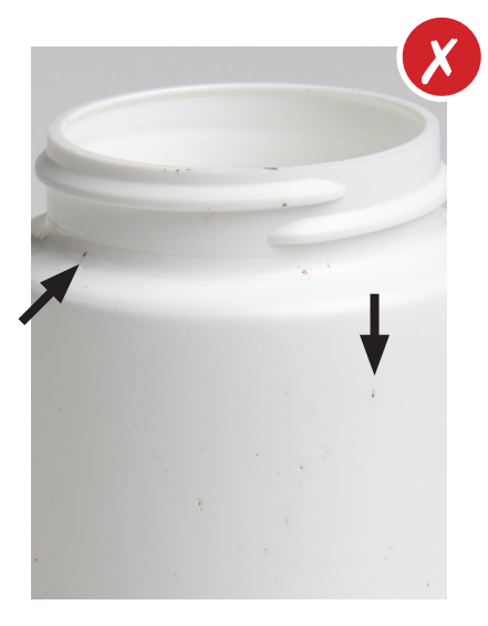
Foreign Material Results in eroded consumer confidence from carbonized resin or other trapped material