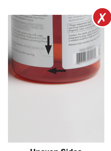
Uneven Sides Result in uneven, wrinkled labels that decrease copy readability and look unprofessional