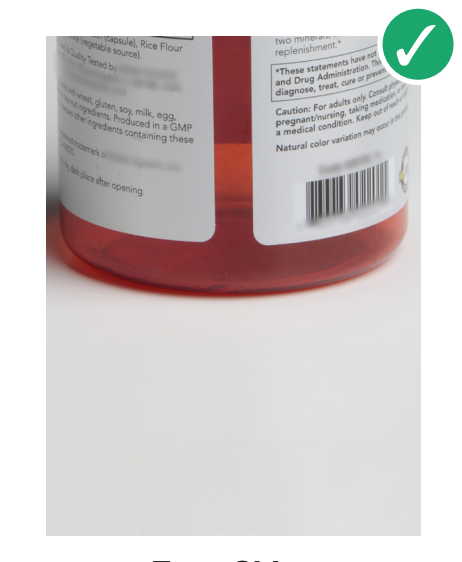
Even Sides Ensures labels lie flat, are easy to read, and look perfect