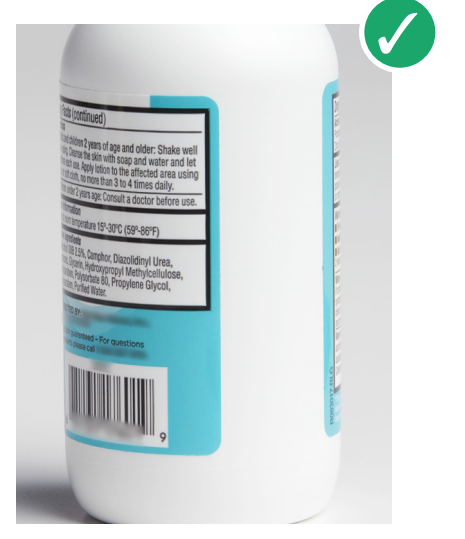
Properly Spec'd Material Ensures bottle integrity is maintained and the product is aesthetically pleasing