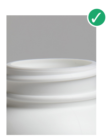
Even Sealing Surface Ensures a perfect closure seal and product protection