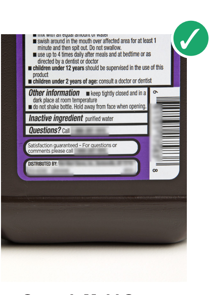
Smooth Mold Seam Ensures labels are easy to read and look great