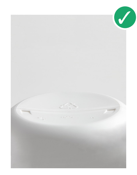
No Bottom Flash Ensures stable bottles, a quality printing surface and a superior brand impression