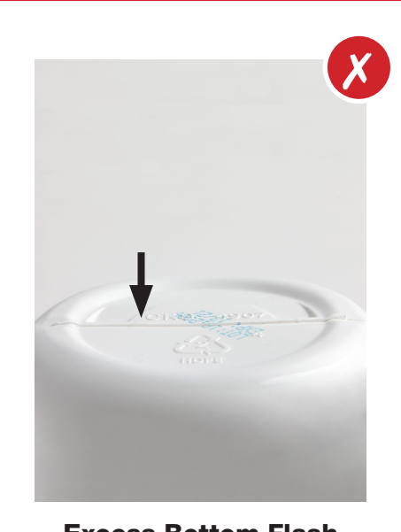
Excess Bottom Flash Results in bottle stability issues, a poor printing surface and a mediocre brand impression