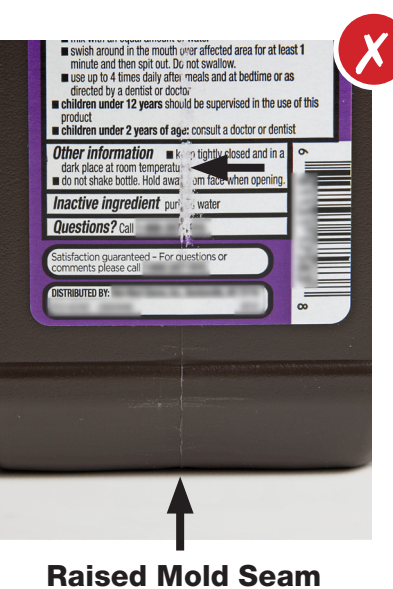
Results in abrasion that makes labels illegible