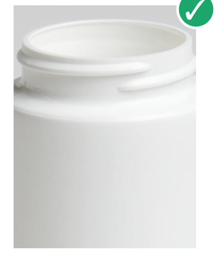
No Foreign Material Ensures the bottle looks crisp and clean, which builds product confidence