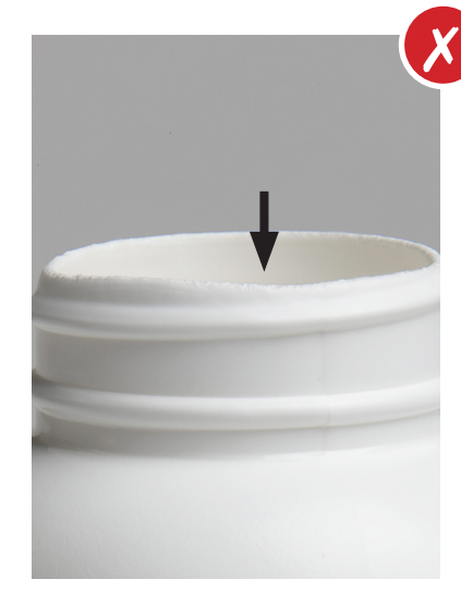
Uneven Sealing Surface Results in poor closure seal and increased risk of product contamination