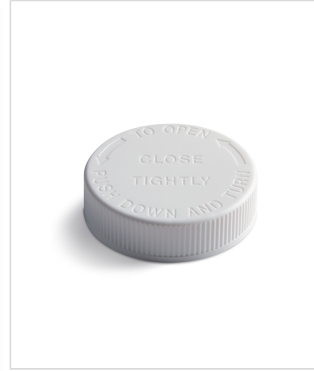
PharmaSure™ 53 mm SecuRx® Ribbed Side Text Top CRC