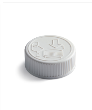
38 mm SecuRx® Ribbed Side Pictorial Top CRC