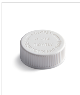
38 mm SecuRx® Ribbed Side Text Top CRC