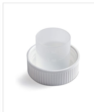
38 mm SecuRx® 15ml Dosage Cap™ with Ribbed Side Text Top