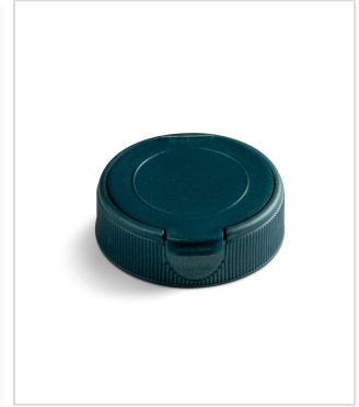
38 mm THUMBLE- EZY® Dispensing Top with Raised Ring