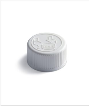
24 mm SecuRx® Ribbed Side Pictorial Top CRC