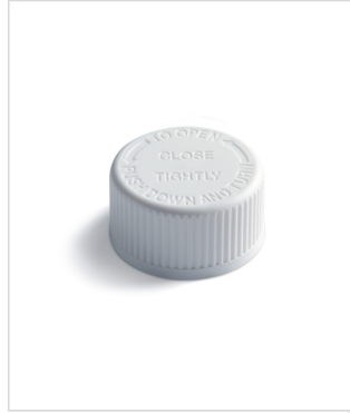
24 mm SecuRx® Ribbed Side Text Top CRC