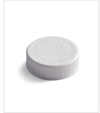
45 mm SecuRx® Ribbed Side Text Top CRC