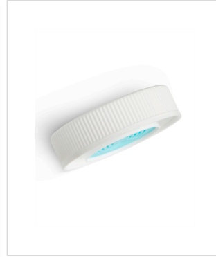
53 mm SecuRx® Ribbed Side Smooth Top 2-Way Humidity Control CRC