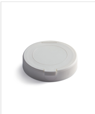
53 mm THUMBLE- EZY® Dispensing Top with Raised Ring