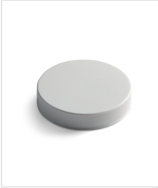
53 mm Continuous Thread Ribbed Side Smooth Top