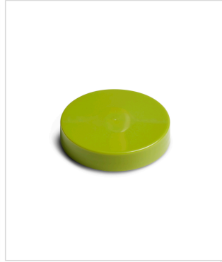
53 mm Continuous Thread Smooth Side Smooth Top