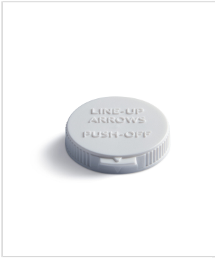
33 mm Snap Cap Text Top CRC