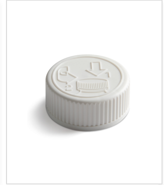
33 mm SecuRx® Ribbed Side Pictorial Top CRC