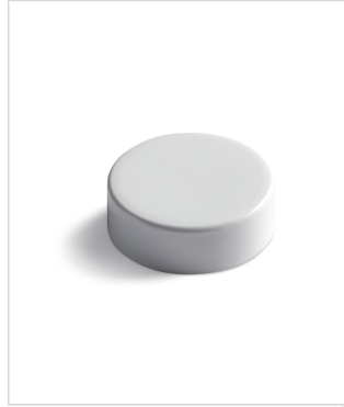
33 mm Continuous Thread Smooth Side Smooth Top