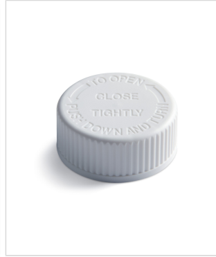
33 mm SecuRx® Ribbed Side Text Top CRC