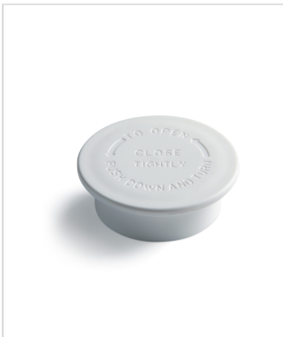
33 mm SecuRx® SMAT Cap Text Top CRC