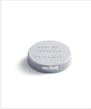
33 mm Snap Cap Text Top CRC