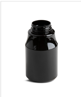
400 cc Apothecary Round