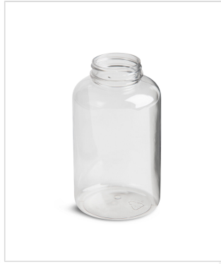
500 cc Classic Series Wide-Mouth Round