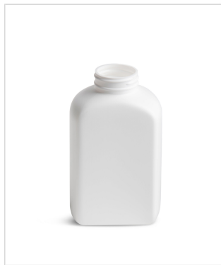
625 cc Wide-Mouth Oblong