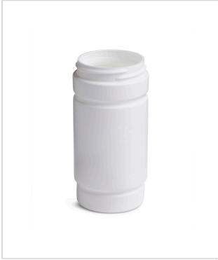
175 cc Ionic Round