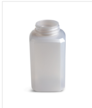
400 cc Wide-Mouth Beveled Square