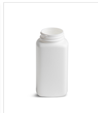
250 cc Wide-Mouth Oblong