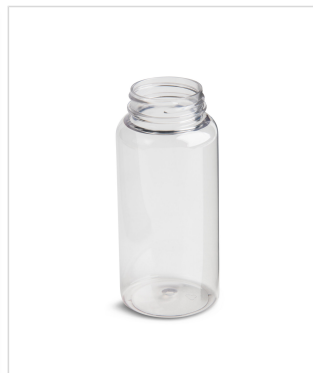
300 cc Classic Series Wide-Mouth Round