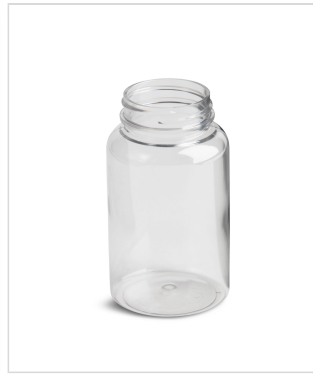
225 cc Classic Series Wide-Mouth Round