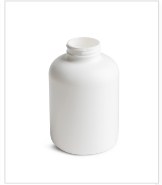
625 cc Classic Series Wide-Mouth Round