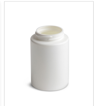
185 cc Wide-Mouth Cylinder