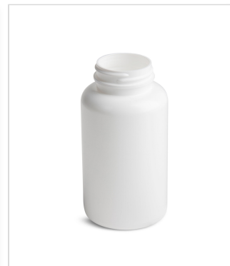
300 cc Classic Series Wide-Mouth Round