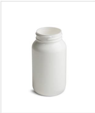
200 cc Artistic Series Wide-Mouth Round