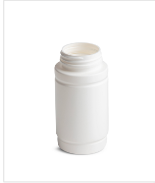
200 cc Ionic Round