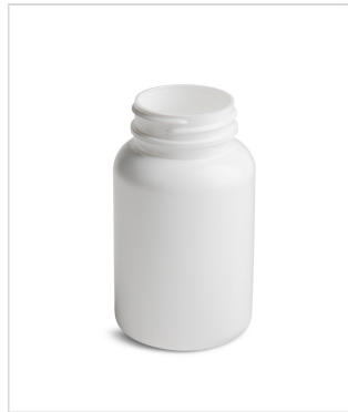
200 cc Artistic Series Wide-Mouth Round