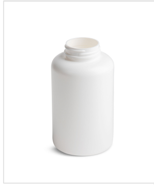
500 cc Classic Series Wide-Mouth Round