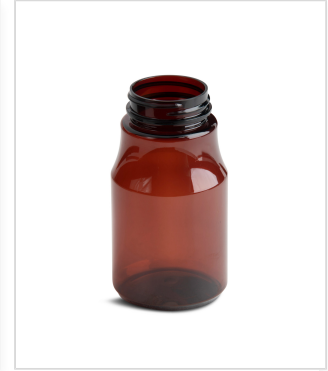
300 cc Apothecary Round