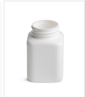
200 cc Wide-Mouth Square