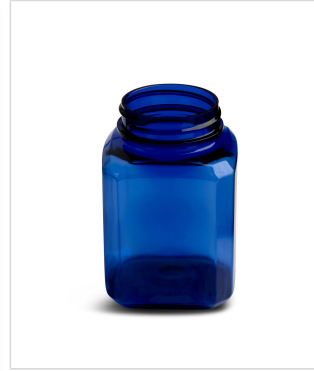
200 cc Wide-Mouth Beveled Square