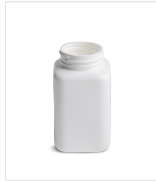
230 cc Wide-Mouth Square