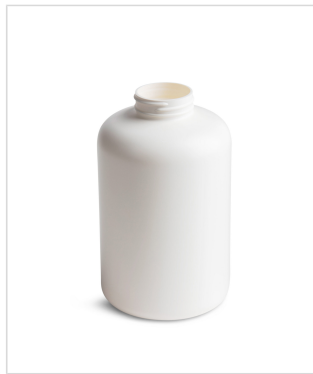
950 cc Classic Series Wide-Mouth Round