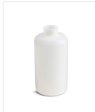
1300 cc Artistic Series Wide-Mouth Round