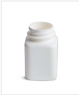
200 cc Wide-Mouth Square