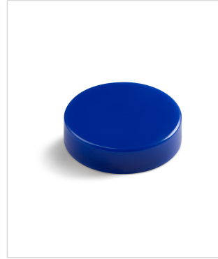
45 mm Continuous Thread Smooth Side Smooth Top