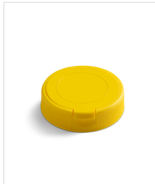
45 mm THUMBLE-EZY® Dispensing Top with Raised Ring