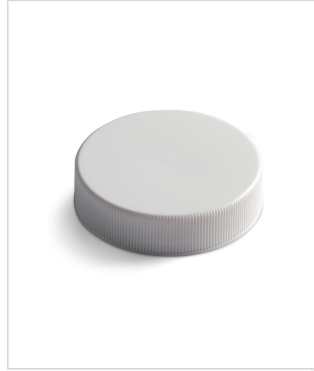
45 mm Continuous Thread Ribbed Side Smooth Top