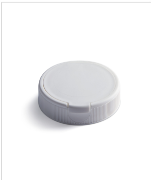
45 mm THUMBLE-EZY® Dispensing Top