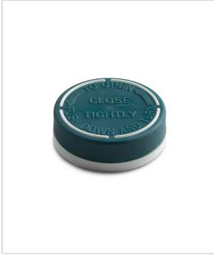
45 mm GripMax™ Text Top CRC