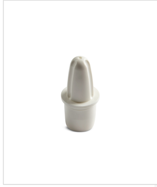
18 mm Nasal Spray Tip