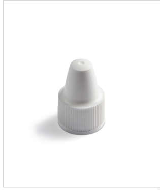
18 mm Nasal Spray Continuous Thread Closure