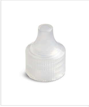
18 mm Dropper Tip Continuous Thread Closure