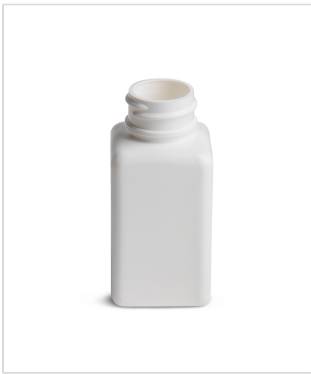
50 cc Wide-Mouth Square