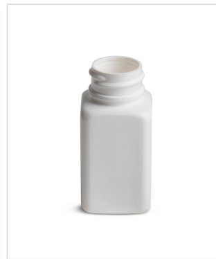
45 cc Wide-Mouth Square