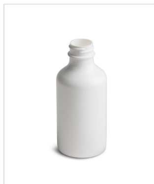
2 oz Modern Boston Round