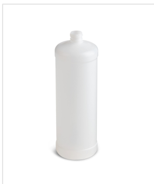
16 oz Panelled Cylinder