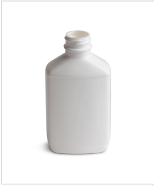
4 oz Century Oval