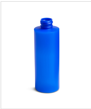
6 oz Standard Cylinder