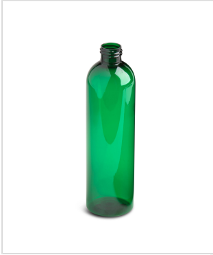
10 oz Prince Cylinder