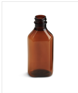
4 oz Rx Oval