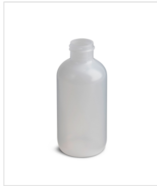
8 oz Standard Cylinder