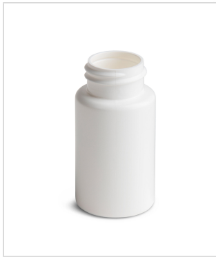
8 oz Prince Cylinder