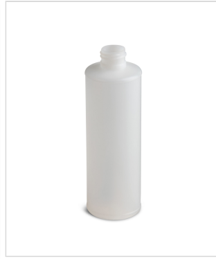
8 oz Panelled Cylinder