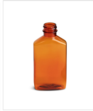
4 oz Drug Oval