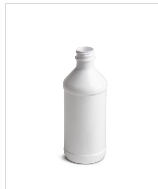
8 oz Bumpered Boston Round