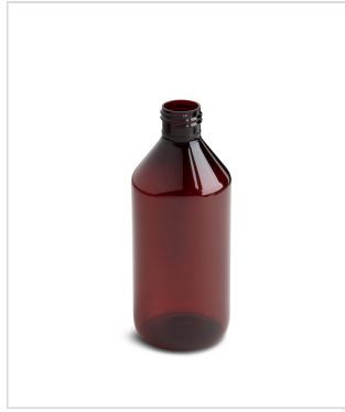
8 oz Modern Boston Round