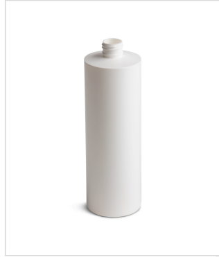
16 oz Standard Cylinder