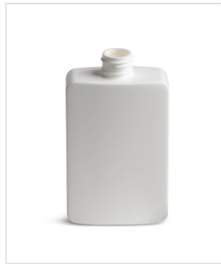
8 oz Classic Oblong