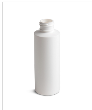
4 oz Standard Cylinder