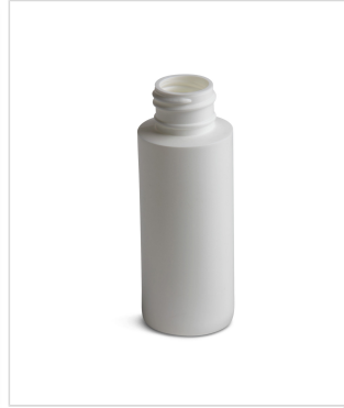
2 oz Standard Cylinder