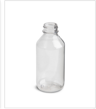
4 oz Modern Boston Round