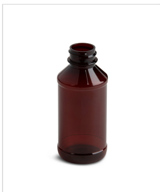
12 oz Modern Boston Round