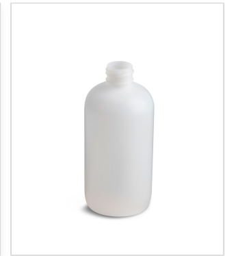
8 oz Boston Round