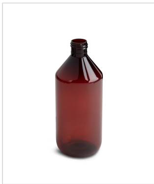
1 oz Contemporary Series Wide-Mouth Round