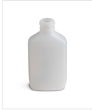
4 oz Century Oval