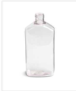
8 oz Standard Cylinder