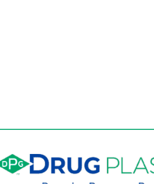
3 oz Bumpered Boston Round