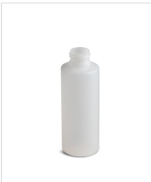
4 oz Panelled Cylinder