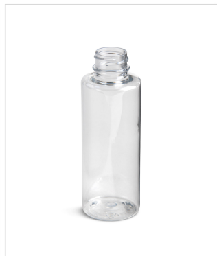
4 oz Standard Cylinder