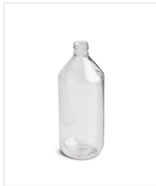
100 ml Boston Round