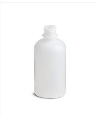
8 oz Boston Round