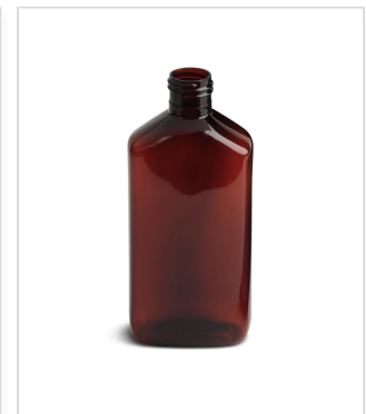
8 oz Drug Oval