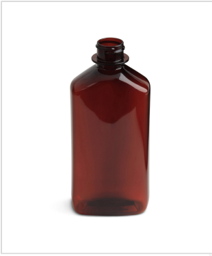
8 oz Drug Oval