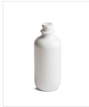
8 oz Boston Round