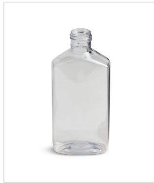
6 oz Drug Oval