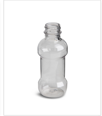
3 oz Bulb Round