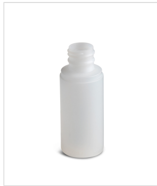
60 ml Standard Cylinder