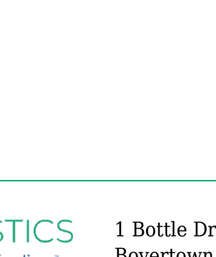
30 cc Wide-Mouth Square