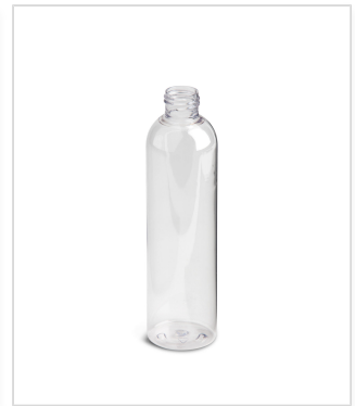
8 oz Prince Cylinder