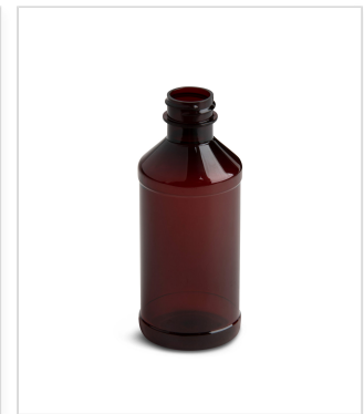
5 oz Bumpered Boston Round