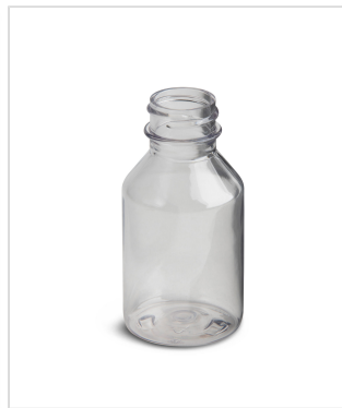
12 oz Drug Oval