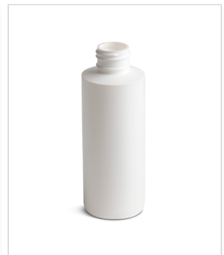
4 oz Standard Cylinder