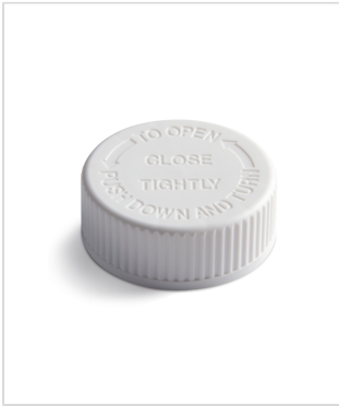
38 mm SecuRx® Ribbed Side Text Top CRC