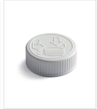
38 mm SecuRx® Ribbed Side Pictorial Top CRC