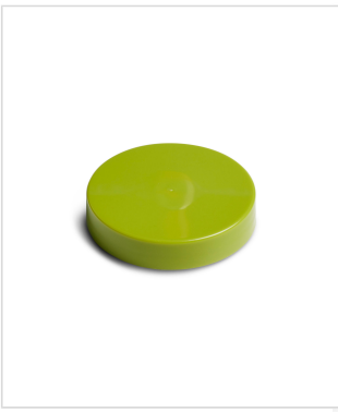
53 mm Continuous Thread Smooth Side Smooth Top