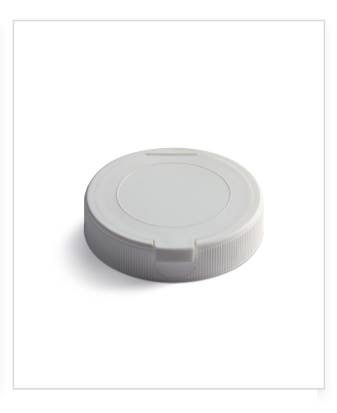
53 mm THUMBLE-EZY® Dispensing Top with Raised Ring

Phone: 1-610-367-5000 Email: info@drugplastics.com