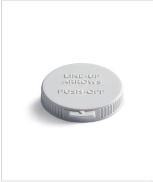
38 mm Snap Cap Text Top CRC