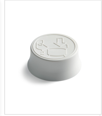
28 mm SecuRx® Cone Smooth Side Pictorial Top CRC