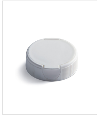
38 mm THUMBLE- EZY® Dispensing Top