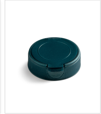
38 mm THUMBLE- EZY® Dispensing Top with Raised Ring