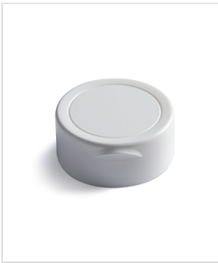
38 mm THUMBLE- EZY® III Dispensing Top