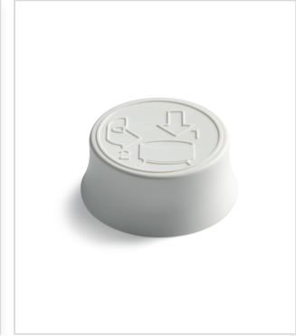
28 mm SecuRx® Cone Smooth Side Pictorial Top CRC