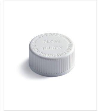
28 mm SecuRx® Ribbed Side Text Top CRC