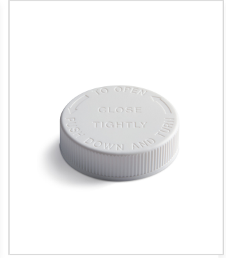
53 mm SecuRx® Ribbed Side Text Top CRC