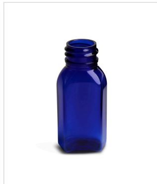
1 oz Dropper Bottle Oval