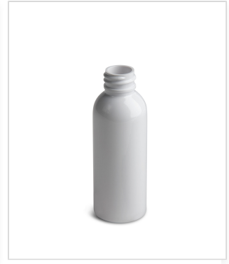
2 oz Prince Cylinder