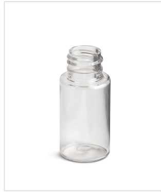
20 ml Cylindrical Vial