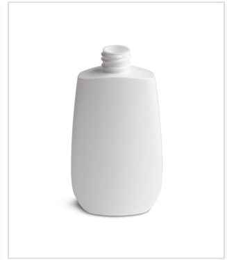
3 oz Standard Oval