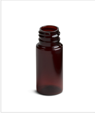
0.5 oz Cylindrical Vial