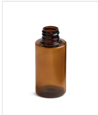
1.5 oz Cylindrical Vial