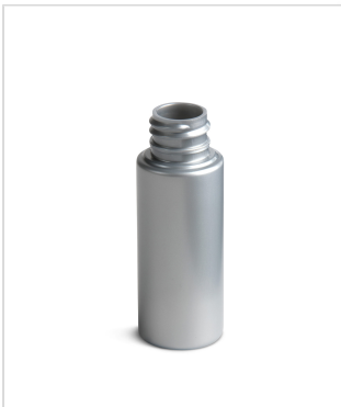
1 oz Cylindrical Vial