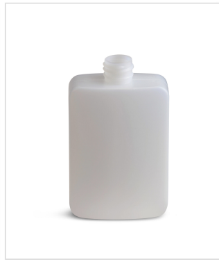
4 oz Classic Oblong