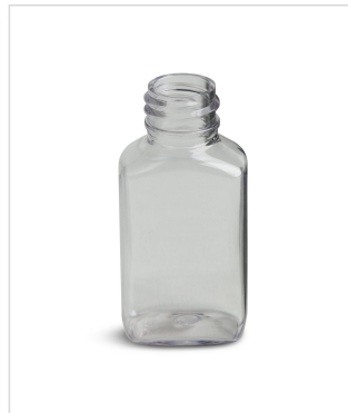
1 oz Drug Oval