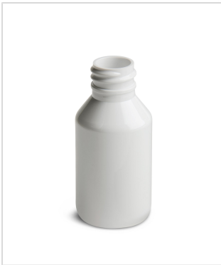
1 oz Modern Boston Round