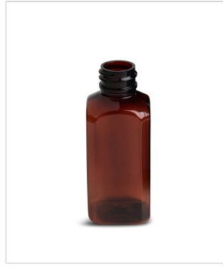
2 oz French Square