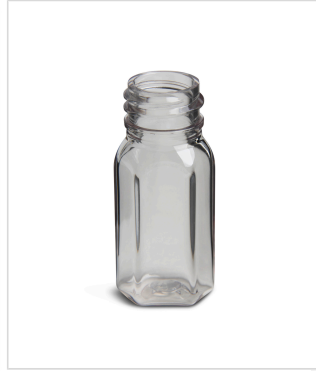
0.5 oz Dropper Bottle Oval