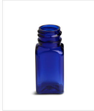
0.5 oz French Square