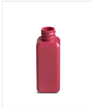
2 oz Beveled Square