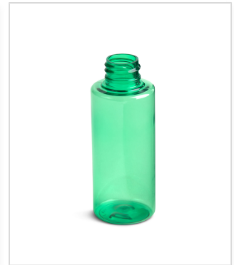
2 oz Cylindrical Vial