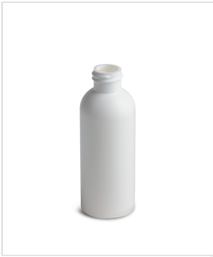
2 oz Prince Cylinder