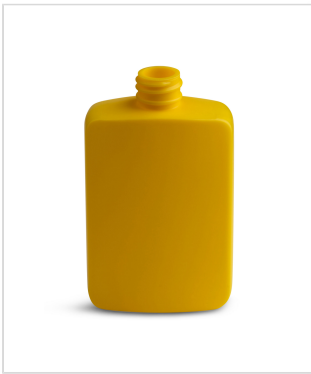
4 oz Classic Oblong