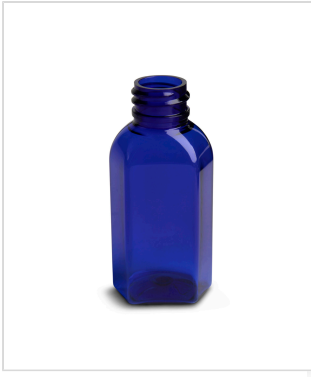
2 oz Dropper Bottle Oval