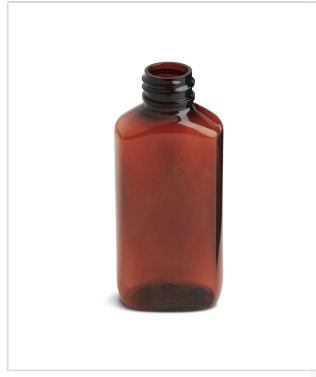
2 oz Drug Oval